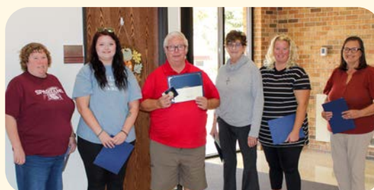
July to September 2024