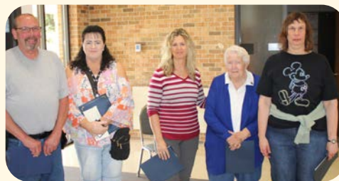
April to June 2024