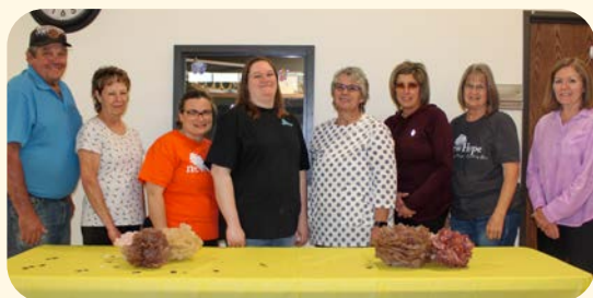
January to March 2024