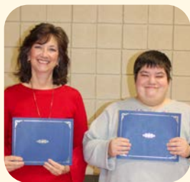
October to December 2023

Employees who reach milestone service anniversaries are honored quarterly with a certificate of achievement. In 2023-2024, New Hope continued to recognize one employee each month with a Bee the Hope Award for their exemplary service to Enriching Lives .